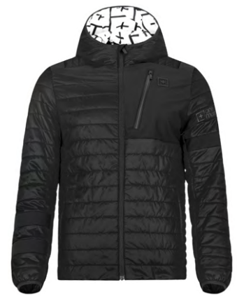
BLK/ BLK / BLK 99BB