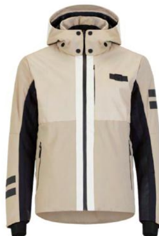
MOSAICO / BLK / WHT 4FBA