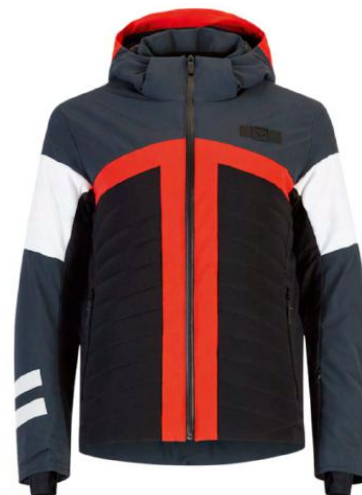
BLK / GRIGIO / BACIO 99IO