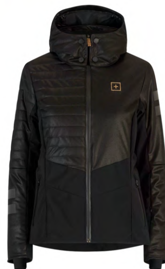
BLK / BLK / BLK 99BB