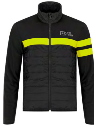
BLK / BLK / BEAT 99BT