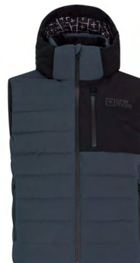
GRIGIO / BLK / BLK 9HBB