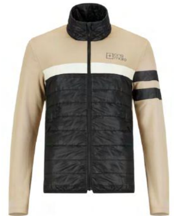
BLK / MOSAICO / WHT 99MA