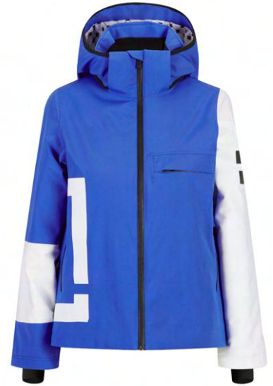
OLTREMARE / WHIT / BLK