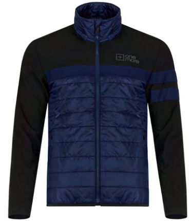
NAVY / BLK / NAVY 33BF