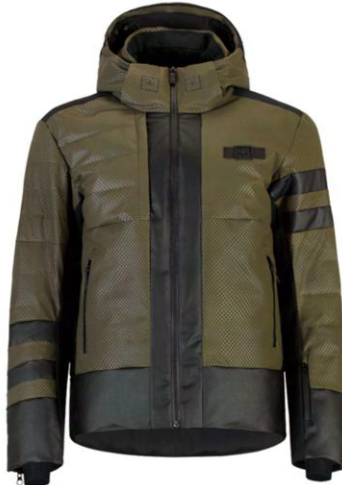
SURVIVOR / BLK / BLK 7EBB

ecodown recycl. fibers by Thermore, 160g