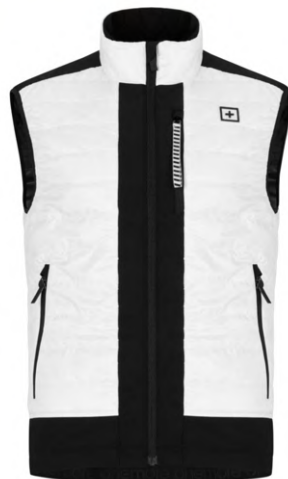
WHT / BLK / BLK 00BB

2 side pockets, 1 front pocket, 3D mesh underneath shoulders, Internal silicon tape, YKK Zippers, OneMore metal buckel logo