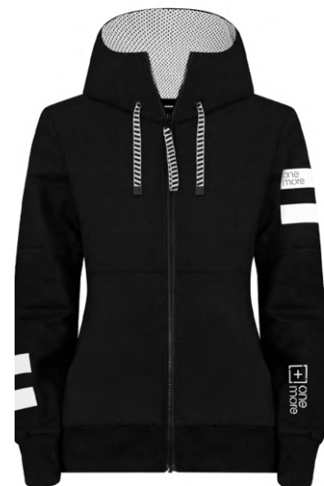
BLK / BLK / WHT 99BA