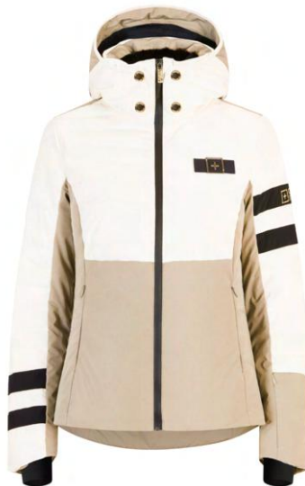
WHT / MOSAICO / BLK OOMB

Detachable and adjustable hood with buttons, Detachable snow gaiter, Collar with internal eco-fur, 2 external pockets, 3 internal pockets (1 with zipper and 2 net pockets), Skipass pocket, Key-holder, Lycra stretch cuffs, 3D mesh underneath shoulders, Breathable internal lining, Adjustable waist, Waterproof YKK zippers, OneMore Reflective Logo