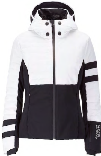
BLK / WHT / BLK 99AB

Detachable and adjustable hood with buttons, Detachable snow gaiter, Collar with internal eco-fur, 2 external pockets, 3 internal pockets (1 with zipper and 2 net pockets), S kipass pocket, Key-holder, Lycra stretch cuffs, 3D mesh underneath shoulders, Breathable internal lining, Adjustable waist, Waterproof YKK zippers, OneMore Reflective Logo