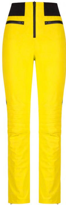
SUN / SUN / BLK 88EB

Half-zip, 2 external pockets, High comfort elastic waistband, Padded knees, Snow gaiters, Adjustable hem with zipped gussets, OneMore Swarovski wording