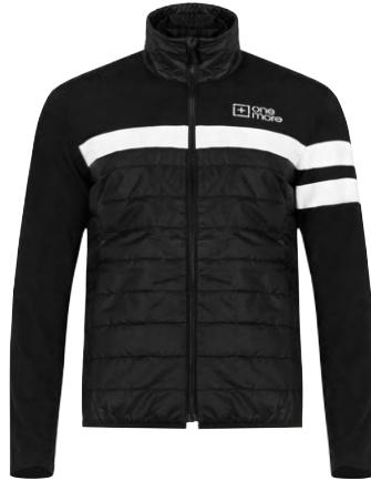
BLK / BLK / WHT 99BA

Full-zip, 2 side pockets, Ultralight padded half body and neck, YKK zippers, OneMore Reflective Logo