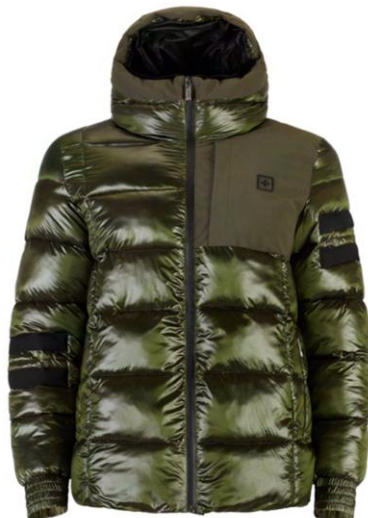
SURVIVOR / BLK / BLK 7EBB