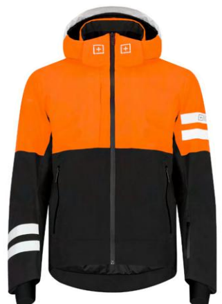
BLK / HOLLAND / WHT 99SA