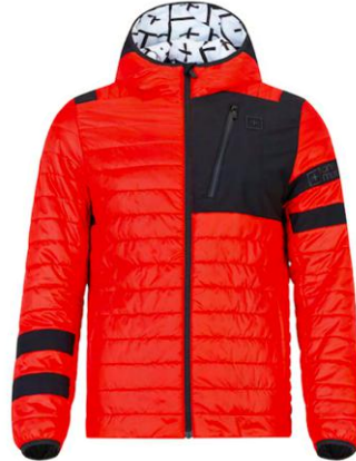
BACIO / BLK / BLK 2DBB