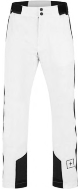
WHT / WHT / BLK 00BB

Half-zip, 2 side pockets, 3D foam edge protection, Snow gaiters, Lycra waist comfort system (+1 size), Belt loops, Waterproof YKK zippers, Cobrax buttons, OneMore Reflective Logo, OneMore Metal buckle Logo