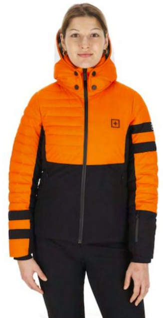
BLK / HOLLAND / BLK 99SA