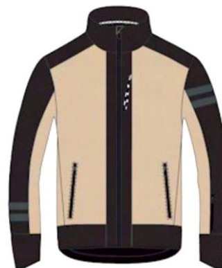
MOSAICO / BLK / BLK 4FBB