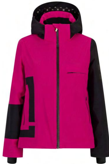
LEVANTE / BLK / BLK