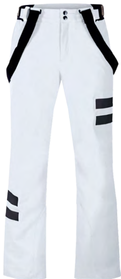
WHT / BLK / BLK 00BB

Fully seam sealed, Half-zip, 2 side pockets, back pocket with zipper, Adjustable snow gaiters, Quick adjustment system for waist, Edge protection in anti- tear Cordura fabric, Lycra comfort waist syste m (+1 size), Belt loops, YKK zippers, OneMore Reflective Logo