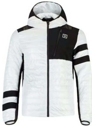
WHT / BLK / BLK 00BB

"Fixed hood, 3 external pockets (2 side and 1 front), 2 internal pocket (1 with zipper and 1 net pocket), Skipassbag inside the external left pocket, Printed lining, Elastic sleeve cuffs, YKK + KCC zipper, OneMore Metal Logo