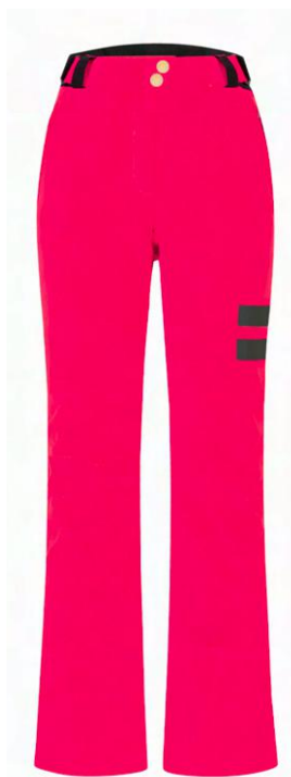
FIZZY / BLK / BLK 5DBB