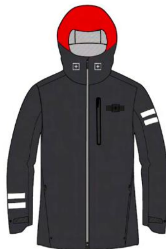
BLK / BACIO/ WHT 990A