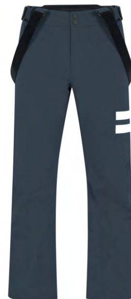
GRIGIO / BLK / WHT 9HBA