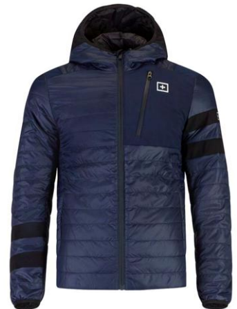
NAVY/ NAVY/ BLK 33FB