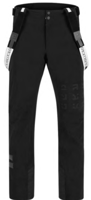
BLK / ALFABLK / BLK 99VB

Half-zip, Padded insert on the left knee, 3 external pockets (2 side zippers and 1 back zipper), Adjustable snow gaiters, Edge protection in anti-tear fabric, Lycra comfort waist system (+1 size), Detachable zip-off braces, Adjustable hem with zipped gussets, Cobra buttons, Belt loops, YKK Zippers, OneMore Reflective Logo