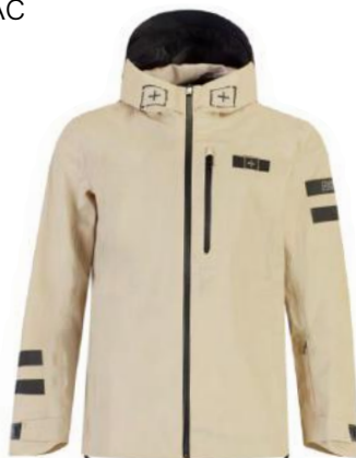
MOSAICO / BLK / BLK 4FBB