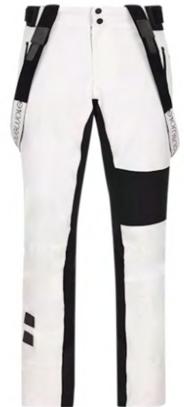
WHT / BLK / BLK 00BB