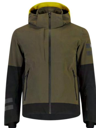
SURVIVOR/ BLK / BLK 7EBB