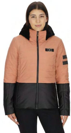
JUPTER / BLK / CHAMPAGNE 2EBK