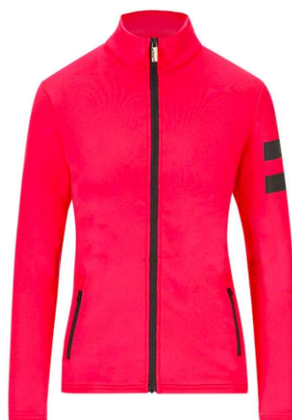
BACIO / BACIO / WHT 2DBA