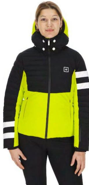
BEAT / BLK / WHT 7CBA