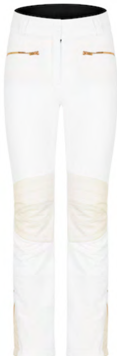
WHT / WHT / CHAMPAGNE 00AK

Half-zip, 2 side pockets, Anti-tear edge protection in Cordura fabric, Snow gaiters, Knee, hip and lower leg padded elements, Belt loops, Waterproof YKK zipper, OneMore Reflective Logo