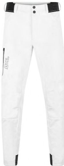
WHT / WHT / WHT 00AA

3 side pockets with concealed zipper, 1 back pocket with button, Elastic waist, Belt loops, Bottom leg cuffs, YKK zippers, OneMore Reflective Logo