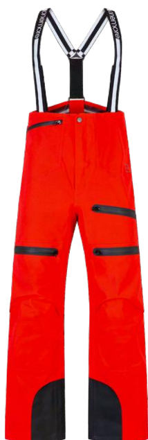
BACIO / BACHIO / BLK 2DOB

Fully seam sealed, Detachable zip-off braces, 2 regular pockets, 2 cargo pockets, Snow gaiters pockets, Anti-tear edge protection, Ventilation system, Waterproof YKK zippers, OneMore Reflective Logo, OneMore Metal buckle Logo