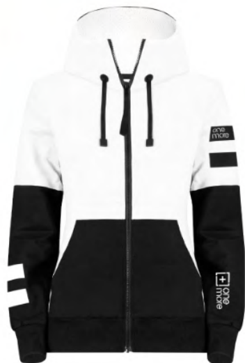
WHT / BLK / WHT 00BA

3 side pockets with concealed zipper, 1 back pocket with button, Elastic waist, Belt loops, Bottom leg cuffs, Cobra buttons, YKK+KCC zippers, OneMore Reflective Logo