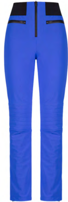
OLTREMARE / OLTREMARE / BLK 3OHA