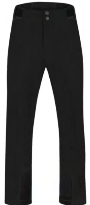
BLK / BLK / BLK 99BB