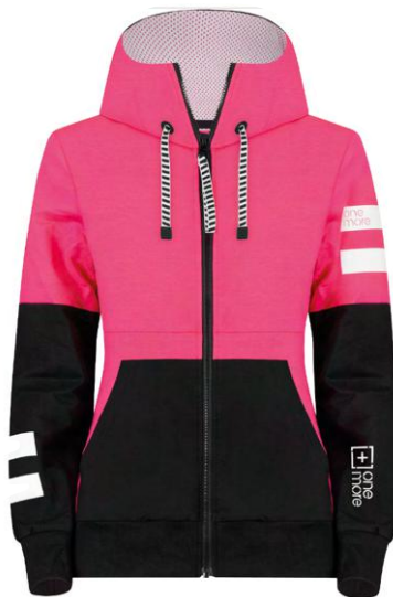
CONDETTI / BLK / WHT 55BA