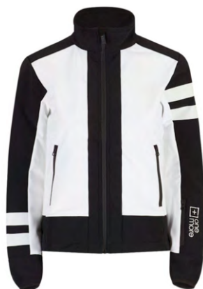
WHT / BLK / WHT 00BA

Full zip, 2 side pockets, 1 front pocket with long puller, Ski pass pocket, 3D mesh underneath shoulders, Internal silicon tape for maximum freedom of movement, OneMore reflective logo