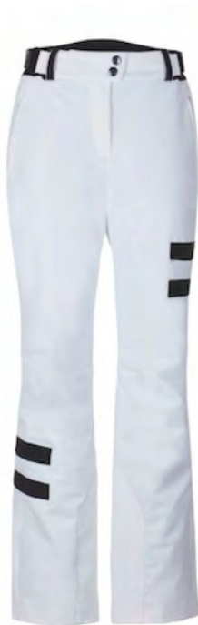
WHT / BLK / BLK 00BB

Fully seam sealed, Half-zip, 2 side pockets, Quick adjustment system for waist, Adjustable snow gaiters, Edge protection in anti-tear Cordura Fabric, Lycra comfort waist system (+1 size), Belt loops, YKK zippers, OneMore Reflective Logo