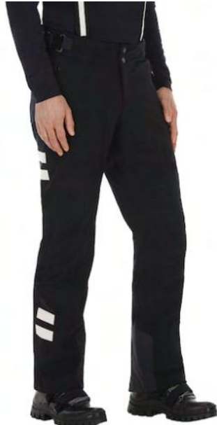
BLK / BLK / WHT 99BA

Half-zip, Padded insert on the left knee, 3 external pockets (2 side zippers and 1 back zipper), Adjustable snow gaiters, Edge protection in anti-tear fabric, Lycra comfort waist system (+1 size), Detachable zip-off braces, Adjustable hem with zipped gussets, Cobrax buttons, Belt loops, YKK Zippers, OneMore Reflective Logo