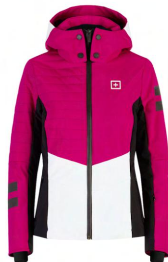
LEVANTE / WHIT / BLK 5EBA