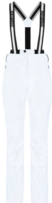
WHT / WHT / WHT 00AA

Half-zip, 2 side pockets, Quick adjustment system for waist, High waist with zip, Detachable zip-off braces, Snow gaiters, Lycra comfort waist system (+1 size), Belt loops, Cobrax buttons, YKK zippers, OneMore Reflective Logo