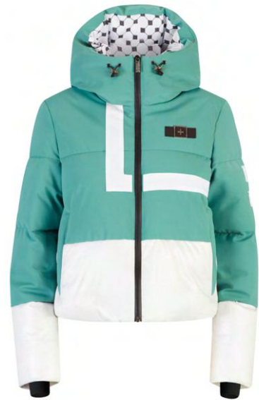
STONEBLU /WHT / WHT 3PAA