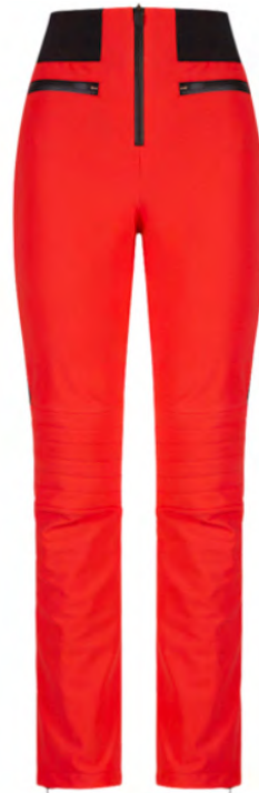
BACIO / BACIO / BLK 2DOB