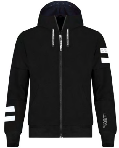
BLK / BLK / WHT 99BA