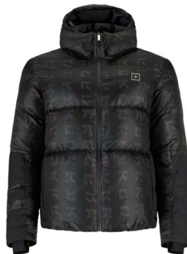
ALFABLACK / BLK / BLK 9LBB