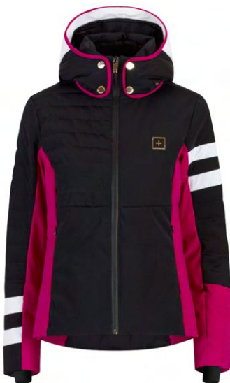
BLK / FIZZY/ WHT 99PA