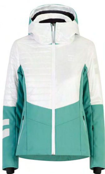
WHT / STONEBLUE / WHT 003A

詳細 Detachable and adjustable hood, 2 external pockets, 4 internal pockets (1 with zipper, 1 with button, 2 net pockets), Skipass- pocket on the left sleeve, Fixed snow gaiter with silicone tape, Lycra stretch cuff, 3D mesh underneath shoulders, Breathable internal lining, logoed buttons, Zip shield with OneMore Reflective Logo, logoed-puller, Waterproof YKK Zippers, OneMore Metal Logo, OneMore Reflective wording on the back