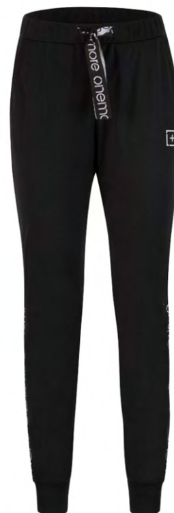
BLK / BLK / BLK 99BB