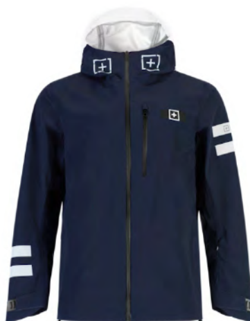
NAVY/ WHT / WHT 33AA