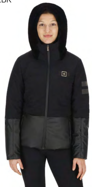
BLK / BLK / CHAMPAGNE 99BK