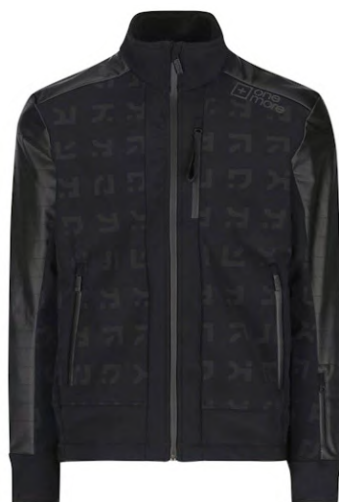
ALFABLACK / BLK / BLK 99BB

Full zip, 2 side pockets, 1 front pocket with long puller, Ski pass pocket, 3D mesh underneath shoulders, Internal silicon tape for maximum freedom of movement, OneMore reflective Logo