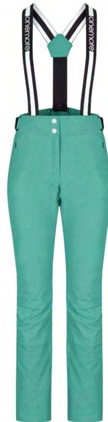
STONEBLU / WHT/ WHT 3PAA