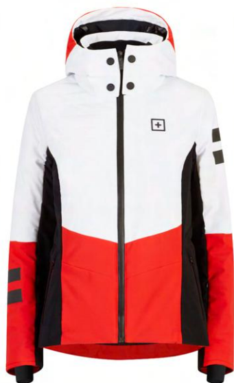
WHT / BACIO / BLK 000B

詳細 Detachable and adjustable hood, 2 external pockets, 4 internal pockets (1 with zipper, 1 with button, 2 net pockets), Skipass-pocket on the left sleeve, Fixed snow gaiter with silicone tape, Lycra stretch cuff, 3D mesh underneath shoulders, Breathable internal lining, logoed buttons, Zip shield with OneMore Reflective Logo, logoed-puller, Waterproof YKK Zippers, OneMore Metal Logo, OneMore Reflective wording on the back