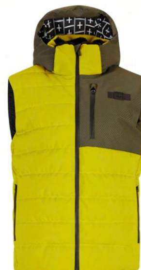
JOKER/ SURVIVOR / BLK 717B