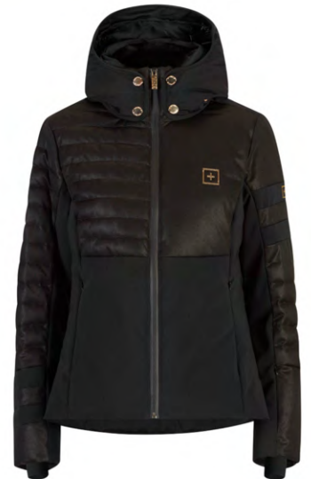
BLACK / BLK / BLK 99BB