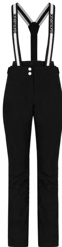
BABYLON / WHT / WHT 5BAA