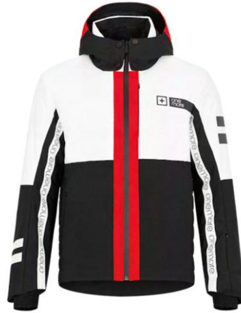
BLK / WHT / BACIO 99AO