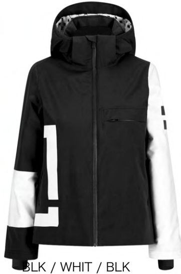
BLK / WHIT / BLK

Detachable and adjustable hood, 3 external pockets, 4 internal pockets (1 with zipper, 1 with button, 2 net pockets), Detachable snow gaiter, Lycra stretch cuff, 3D mesh underneath shoulders, Beathable internal lining, Zipped gussets on the hips, Zip shield with OneMore Reflective Logo, Waterproof YKK Zippers