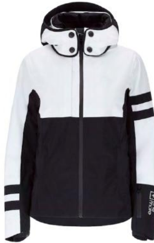
BLK / FIZZY / WHT 99PA

詳細 Fully seam sealed, Detachable and adjustable hood with buttons, Arm pit zips, Detachable snow gaiter, Collar with internal fleece, 3 external pockets (2 side and 1 front with long puller), 3 internal pockets (1 with zipper and 2 net pockets), Skipass pocket, Wide back pocket, Key- holder, Lycra sleeve cuffs, 3D mesh underneath shoulders, Technical zipper for customization, Breathable internal lining, Adjustable waist, Waterproof YKK-Zippers, OneMore reflective Logo