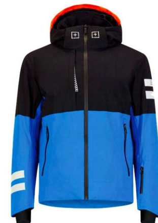
PARROT / BLK / HOLLAND 3MBS