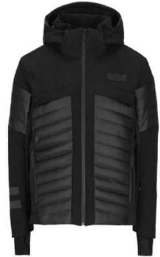
BLK / BLK / BLK 99BB