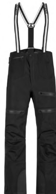
BLK / BLK / BLK 99BB