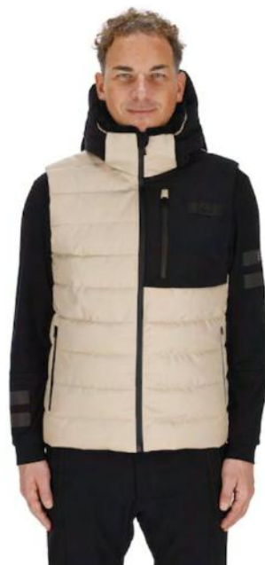
MOSAICO / BLK / BLK 4FBB

Detachable and adjustable hood with buttons, Collar with internal eco-fur, 3 external pockets, 4 internal pockets (1 with button and 3 net pockets), Detachable face protection mask with ventilation holes, Waterproof YKK zipper, OneMore Reflective Logo