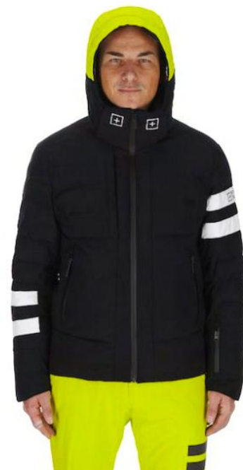
BLK / WHT / BEAT 99BT