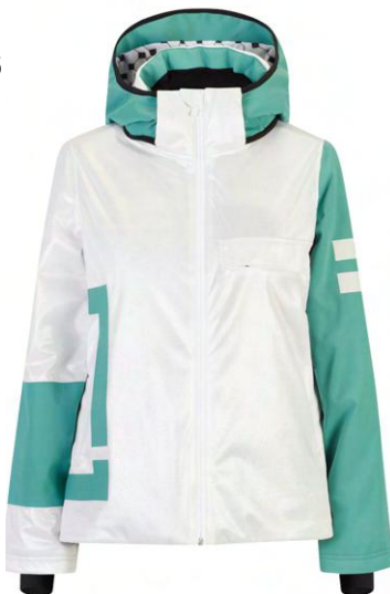
WHT / STONEBLUE / WHT