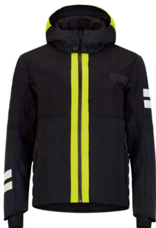
BLK / BEAT / BWHT 99TA