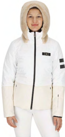
WHT/ WHT/ CHAMPAGNE 00AK

Adjustable fixed hood, Collar with eco-fur, 2 external pockets with concealed zipper, 2 internal pockets (1 with zipper, 1 with button), 1 Skipass pocket with concealed zipper on the left sleeve, Fixed snow-gaiter, Lycra stretch cuff, Adjustable waist, Breathable printed internal lining, 3D internal mesh underneath shoulders, YKK Zippers, Zip-shield with OneMore Reflective Logo, logoed puller, One More Metal Logo