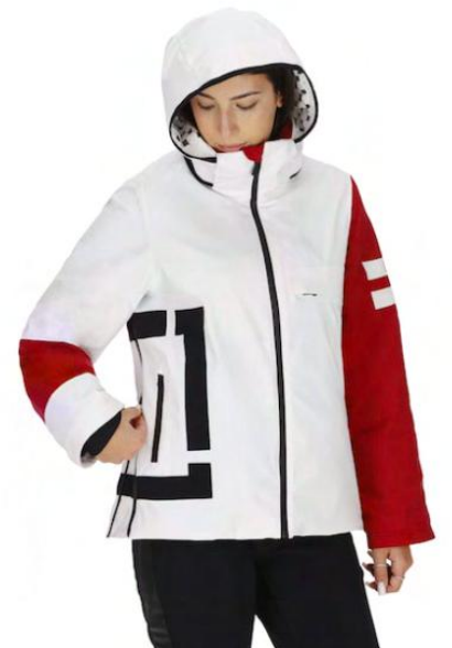
WHT / BABYLON / BLK 004A