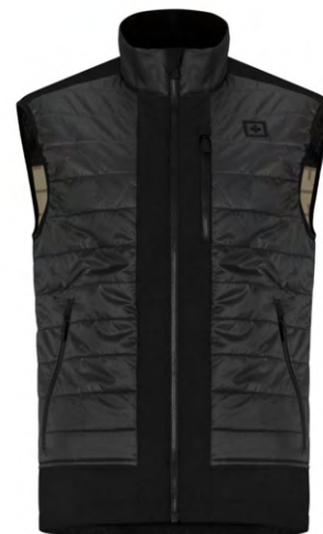
BLK / BLK / BLK 99BB