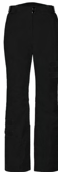
BLK / BLK / BLK 99BB