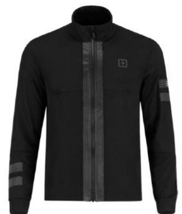
BLK / BLK / BLK 99BB