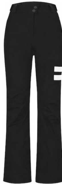
BLK / BLK / WHT 99BA