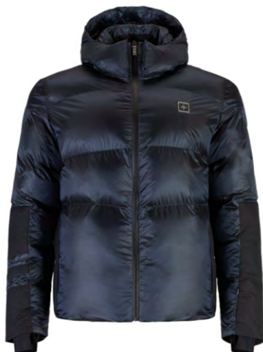
NAVY / BLK / BLK 33BB