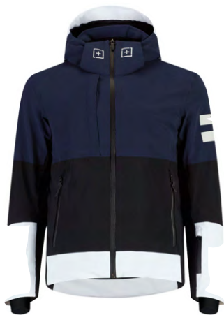
NAVY / BLK / WHT 33BA

Fully seam sealed, Detachable and adjustable hood, Detachable snow gaiter, Arm pit zips, Collar with internal fleece, 3 external pockets (2 side and 1 front with long puller), 4 internal pockets (2 with zipper and 2 net pockets), Skipass pocket, Wide back pocket, Key-holder, Lycra sleeve cuffs, 3D mesh underneath shoulders, Technical zipper for customization, Breathable internal lining, Adjustable waist, Waterproof YKK zippers, OneMore Reflective Logo