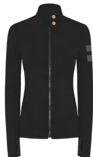
BLK / BLK / CHAMPAGNE 99BK