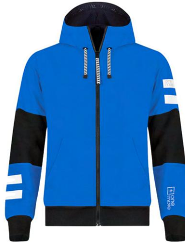
ROYAL / BLK / WHT 3CBA