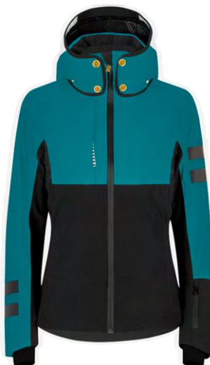
BLK / WHT / BLK 99AB