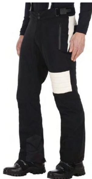
BLK / WHT / BLK 99AB

Half-zip, Padded insert on the left knee, 3 external pockets (2 side zippers and 1 back zipper), Adjustable snow gaiters, Edge protection in anti-tear fabric, Lycra comfort waist system (+1 size), Detachable zip-off braces, Adjustable hem with zipped gussets, Cobrax buttons, Belt loops, YKK Zippers, OneMore Reflective Logo