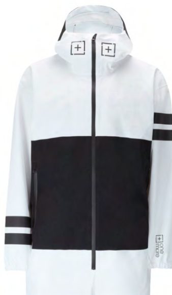
WHT / BLK / BLK 00BA

Fully seam sealed, 2 side pockets, Adjustable hood, Adjustable length with buttons, Elastic sleeve cuffs, Waterproof YKK zippers, OneMore reflective logo