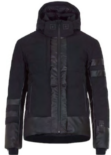
BLK / BLK / BLK 99BB