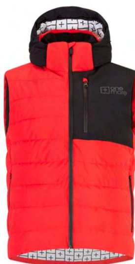
BACIO / BLK / WHT 2DBA

Detachable and adjustable hood with buttons, Collar with internal eco-fur , 3 external pockets, 4 internal pockets (1 with button and 3 net pockets), Detachable face protection mask with ventilation holes, Waterproof YKK zipper, OneMore Reflective Logo