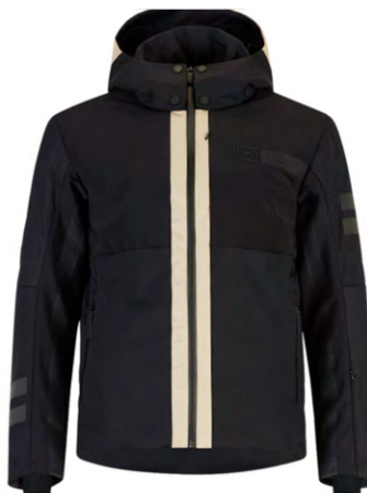
BLK / BLK / MOSAICO 99BM