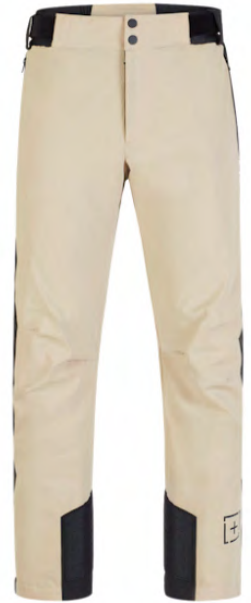
MOSAICO / BLK / BLK 4FBB