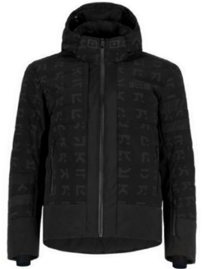
ALFABLK / BLK / BLK 9LBB

Detachable and adjustable hood, Detachable snow gaiter, Collar with internal eco-fur, 3 external pockets (2 side and 1 front with long puller), 3 internal pockets (1 with zipper and 2 net pockets), Sk ipass pocket, Key-holder, Lycra sleeve cuffs, 3D mesh underneath shoulders, Breathable internal lining, Adjustable waist, Waterproof YKK + KCC zippers, OneMore Reflective Logo, OneMore Metal buckle Logo