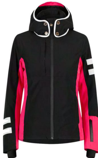
BLK / WHT / BLK 99AB