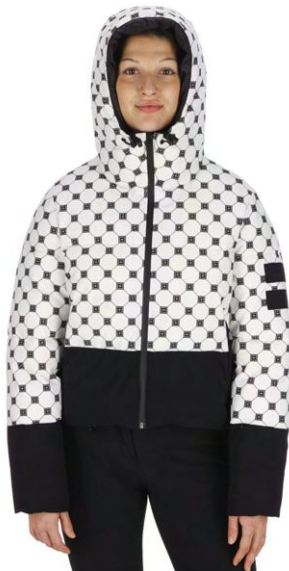
LOGO / BLK / BLK OBBS

Adjustable fixed hood, 2 external pockets, 2 internal pockets (1 with zipper, 1 with button), 1 Skipass pocket with concealed zipper on the left sleeve, Fixed snow gaiter with silicone tape, Lycra stretch cuff, Breathable printed internal lining, 3D internal mesh underneath shoulders, YKK Zippers, Zip-shield with Reflective Logo, logoed puller, OneMore Metal Logo