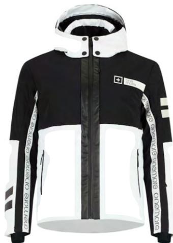
BLK / WHT / BLK 99AB