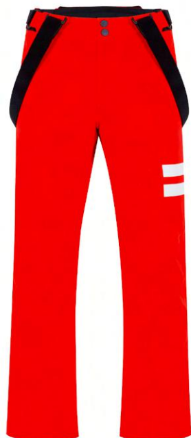
BACIO / BACIO / WHT 2DOA