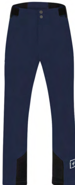
NAVY / NAVY / WHT 33FA