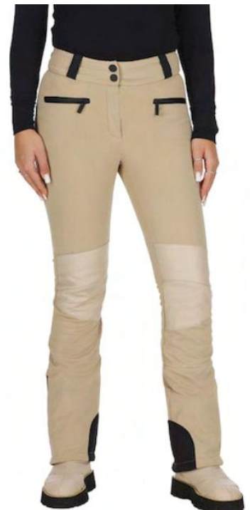
MOSAICO / MOSAICO / BLK 4FMB