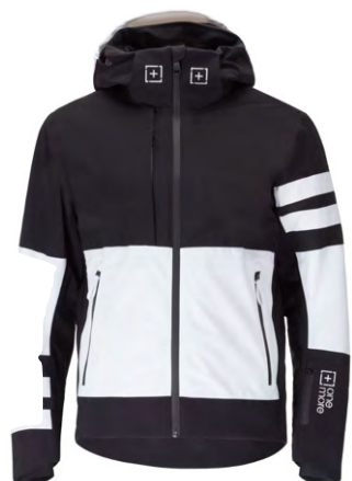
BLK / WHT / BLK 99AB