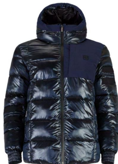
NAVY / BLK / BLK 33BB