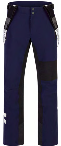
NAVY / BLK/ WHT 33BA