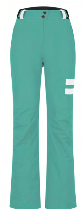
STONEBLU / STONEBLU / WHT 3P3A