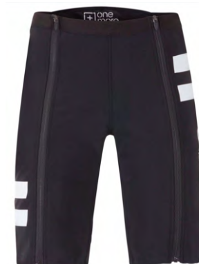
BLK / BLK / WHITE 99BA

2 full zips, Waist in silicone elastic tape, YKK zippers, OneMore reflective logo