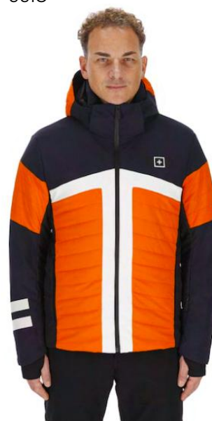
HOLLAND / MARINAIO / WHT 6EWA