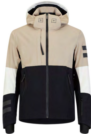
BLK / MOSAICO / WHT 99MA

詳細 Fully seam sealed, Detachable and adjustable hood, Detachable snow gaiter, Arm pit zips, Collar with internal fleece, 3 external pockets (2 side and 1 front with long puller), 4 internal pockets (2 with zipper and 2 net pockets), Skipass pocket, Wide back pocket, Key-holder, Lycra sleeve cuffs, 3D mesh underneath shoulders, Technical zipper for customization, Breathable internal lining, Adjustable waist, Waterproof YKK zippers, OneMore Reflective Logo