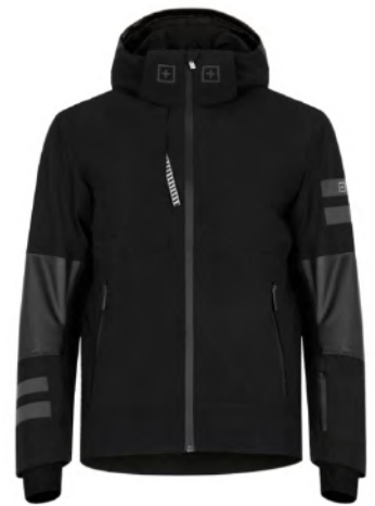
BLK / BLK / BLK 99BB