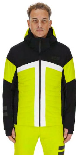
BEAT / BLK / WHT 7CBA