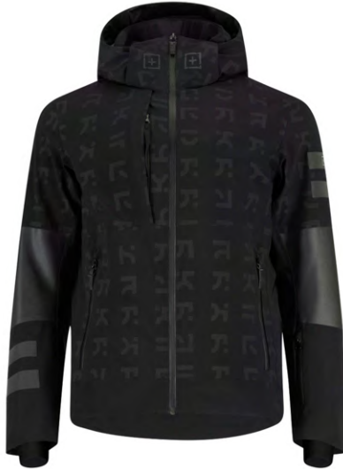
ALFABLK / BLK / BLK 9LBB

Fully seam sealed, Detachable and adjustable hood, Detachable snow gaiter, Arm pit zips, Collar with internal fleece, 3 external pockets (2 side and 1 front with long puller), 4 internal pockets (2 with zipper and 2 net pockets), Skipass pocket, Wide back pocket, Key-holder, Lycra sleeve cuffs, 3D mesh underneath shoulders, Technical zipper for customization, Breathable internal lining, Adjustable waist, Waterproof YKK zippers, OneMore Reflective Logo