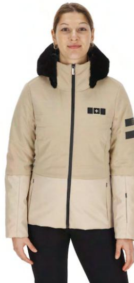
MOSAICO / MOS/ BLK 4FMB