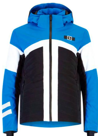
BLK / PARROT/ WHT 99YA