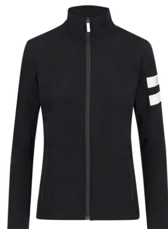
BLK / BLK / WHT 99BA