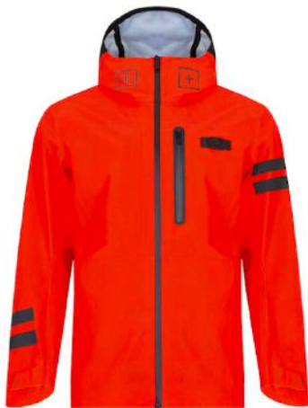
BACIO / BLK / BAC 2DBA

"Fully seam sealed, Fixed adjustable hood, 2 side pockets, 1 front pocket, 1 internal pocket, Skipassbag inside the external left pocket, Zip shield with Reflective Logo, Adjustable sleeve ends with fastener, YKK & KCC waterproof zippers, OneMore Reflective Logo, OneMore Metal Logo