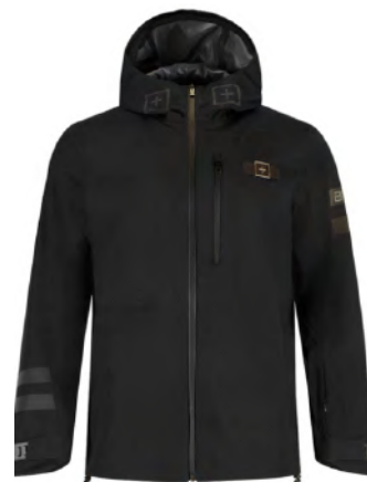
BLK / BLK / BLK 99BB