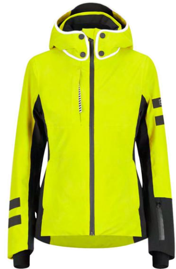
BEAT / BLK / BLK 7CBB