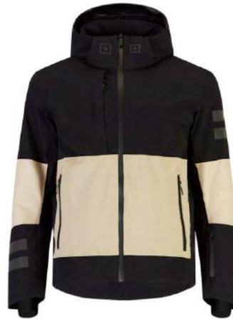
MOSAICO / BLK / BLK 4FBB