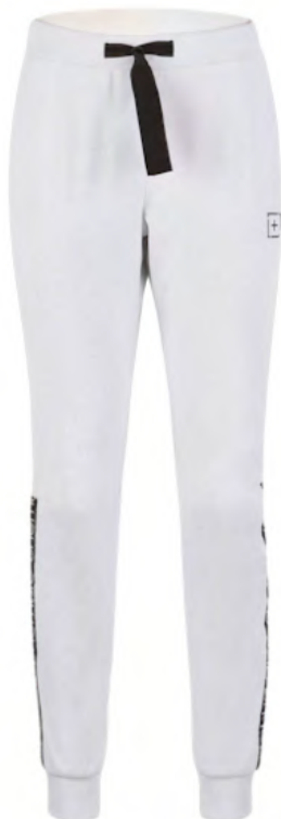
WHT/ WHT / BLK 00AB

2 side pockets, Elastic waistband with logoed drawstring, Bottom leg cuffs, Logo tape, OneMore Reflective Logo