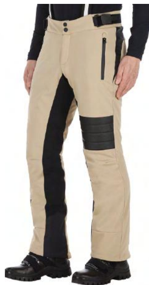
MOSAICO / MOS / BLK 4FBB