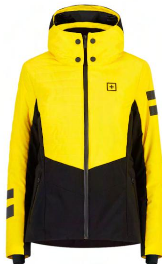
SUN / BLK / BLK 88BB