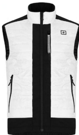
WHT / BLK / BLK 00BB