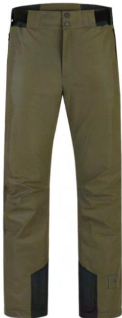
SURVIVOR / BLK / BLK 7E7B