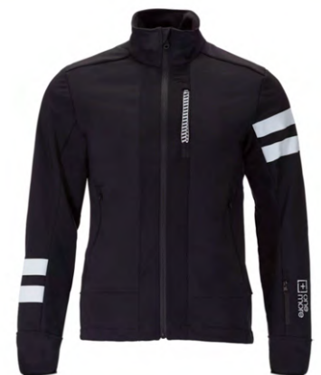
BLK/ BLK / WHT 99BA