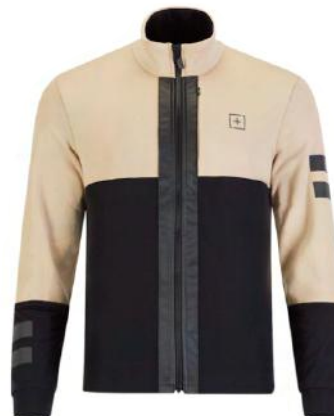
MOSAICO / BLK / BLK 4FBB