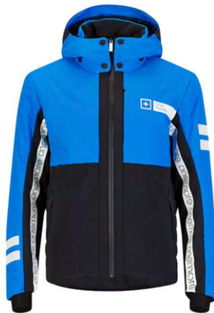
BLK / PARROT / WHT 99YA