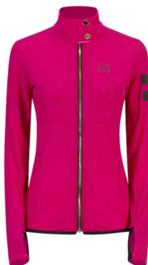
LEVANTE / WHT / BLK 5EAB