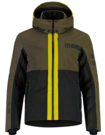
SURVIVOR/ BLK / BLK 7EBB