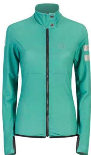
STONEBLU / WHT / SIL 3PAX

Fullzip, High-Neck with buttons, Sleeve cuffs with thumbhole, YKK Zipper, OneMore Reflective Logo