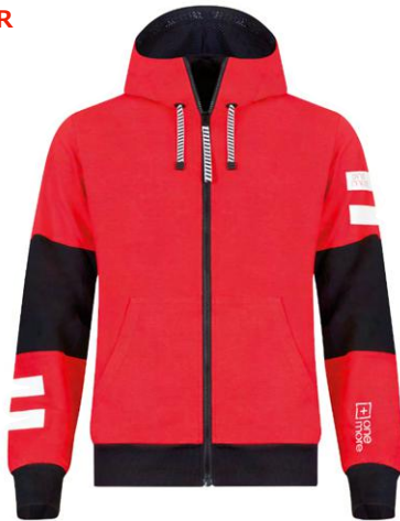
REDE / BLK / WHT 22BA

Full-zip with long puller, Kangaroo pockets, Adjustable hood, Elastic sleeve cuffs, OneMore Reflective Logo