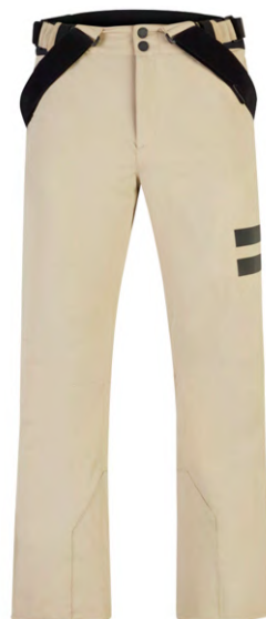
MOSAICO / BLK / BLK 4FBB