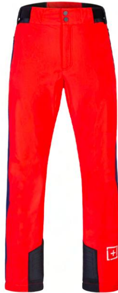
BACIO / BLK / WHT 2DBA