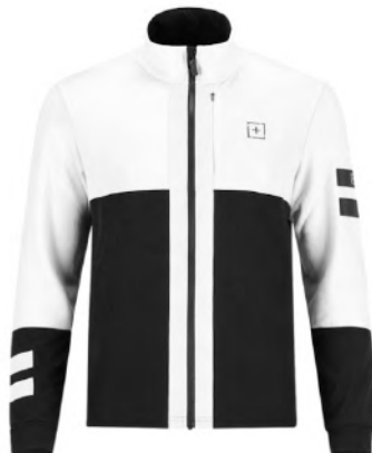
BLK / WHT / WHT 99AA

Full-zip with logoed puller, High-neck, 2 side pockets with zipper, 1 front pocket with concealed zip, Lycra sleeve cuffs, YKK zippers, OneMore Reflective Logo