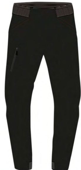
BLK / BLK / BLK 99BB