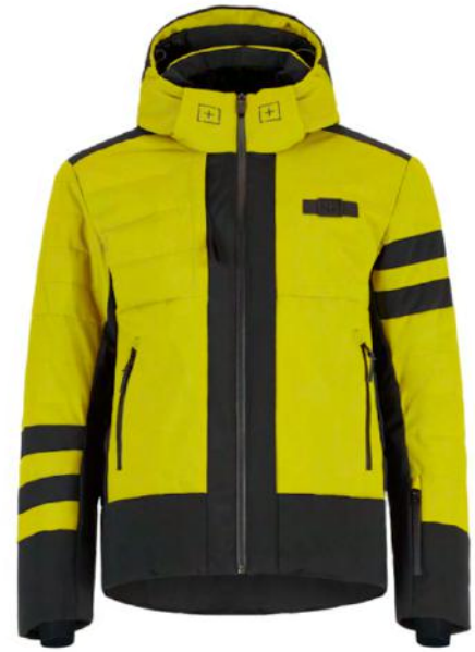
JOKER / BLK / BLK 7IBB