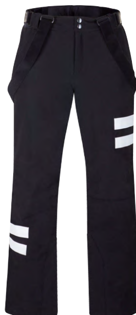
BLK / WHT / WHT 99AA