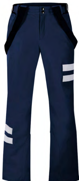
NAVY / NAVY / WHT 33FA