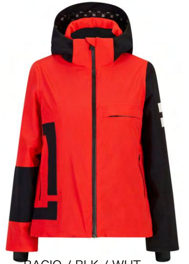
BACIO / BLK / WHT