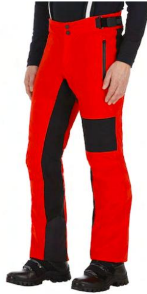
BACIO / BLK / WHT 2DBA