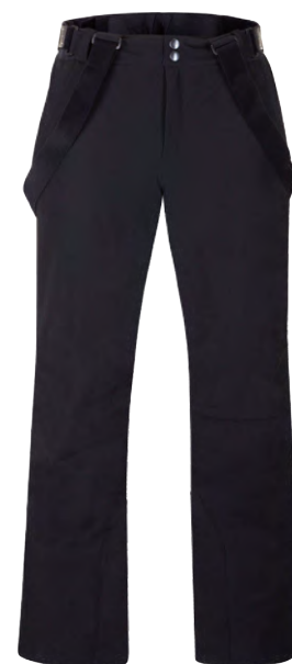
BLK / BLK / BLK 99BB