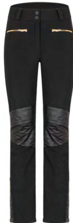
BLK / BLK / CHAMPAGNE 99BK