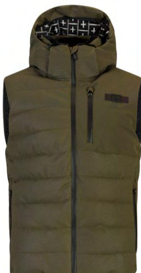
SURVIVOR / SURVIVOR / BLK 7E7B