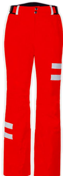
BACIO / WHT / BLK 2DAB