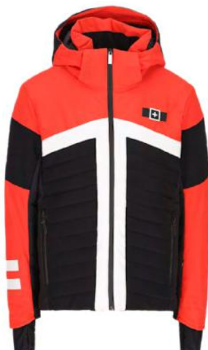
BLK / BACIO/ WHT 990A

Detachable and adjustable hood, 2 external pockets with zipper, 4 internal pockets (3 with zipper and 1 net pocket), Skipass pocket with concealed zip on the left sleeve, Deattachable snow gaiter, Key holder, Lycra stretch cuff with watch and thumb loop, 3D mesh underneath shoulders, Breathable internal lining, Adjustable waist, Zip shield with Reflective Logo, Waterproof YKK Zippers, OneMore Metal Logo