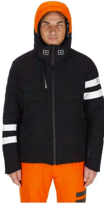
MARNAIO / HOLLAND / WHT 3ESA

Detachable and adjustable hood, Detachable snow gaiter, Collar with internal eco-fur, 3 external pockets (2 side and 1 front with long puller), 3 internal pockets (1 with zipper and 2 net pockets), Sk ipass pocket, Key-holder, Lycra sleeve cuffs, 3D mesh underneath shoulders, Breathable internal lining, Adjustable waist, Waterproof YKK + KCC zippers, OneMore Reflective Logo, OneMore Metal buckle Lo go