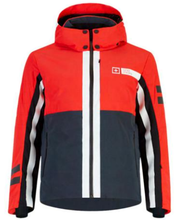
BACIO / GRIGIO / BIANCO 2DIA