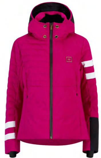
LEVANTE / BLK / WHT 5EBA