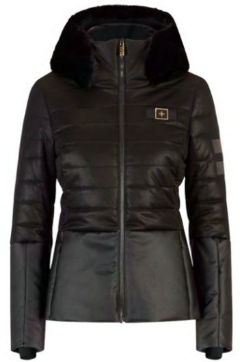
BLK /B LK/ BLK 99BB