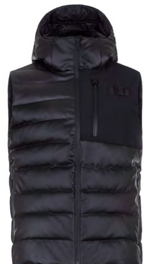
BLK / BLK / BLK 99BB