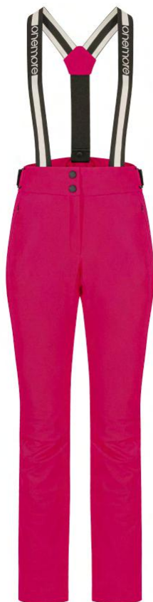
LEVANTE / BLK /BLK 5EBB