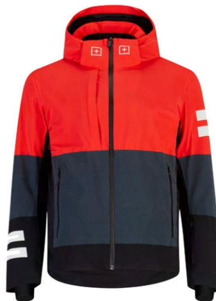
GRAGIO / NACHIO / WHT 9HOA