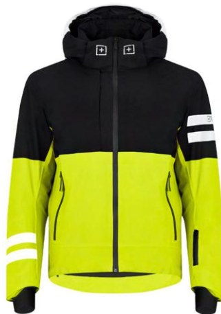
BEAT / BLK / WHT 7CBA