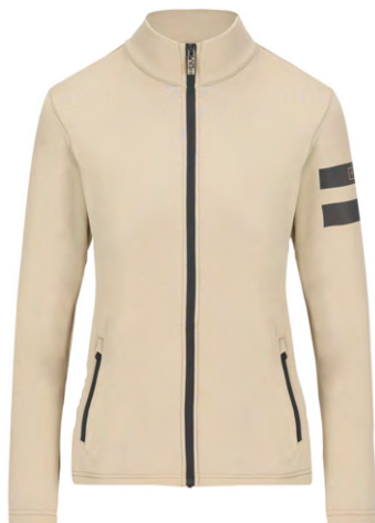
MOSAICO / MOSAICO / BLK 4FMB

Full-zip with logoed puller, High-neck, 2 external pockets with zipper, OneMore Reflective Logo