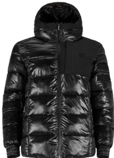
BLK / BLK / BLK 99BB