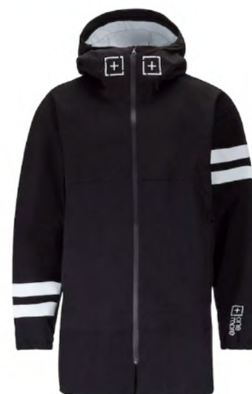
BLK / BLK / WHT 99BA