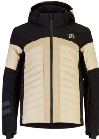
MOSAICO / BLK / MOS 4FBA