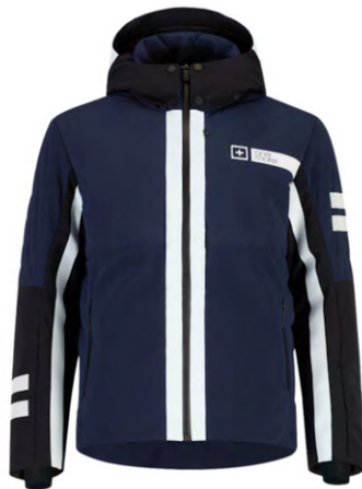
NAVY/ BLK / WHT 33BA

Detachable and adjustable hood, Neck and part of the back with internal eco-fur, 3 external pockets, 3 internal pockets (1 with button and 2 net pockets), Skipass-pocket, Detachable snow gaiter, Key-h older, Stretch cuffs, Breathable internal lining, Adjustable waist, Zip shield with Reflective Logo, Waterproof YKK zippers, OneMore Reflective Logo, OneMore Metal buckle Logo